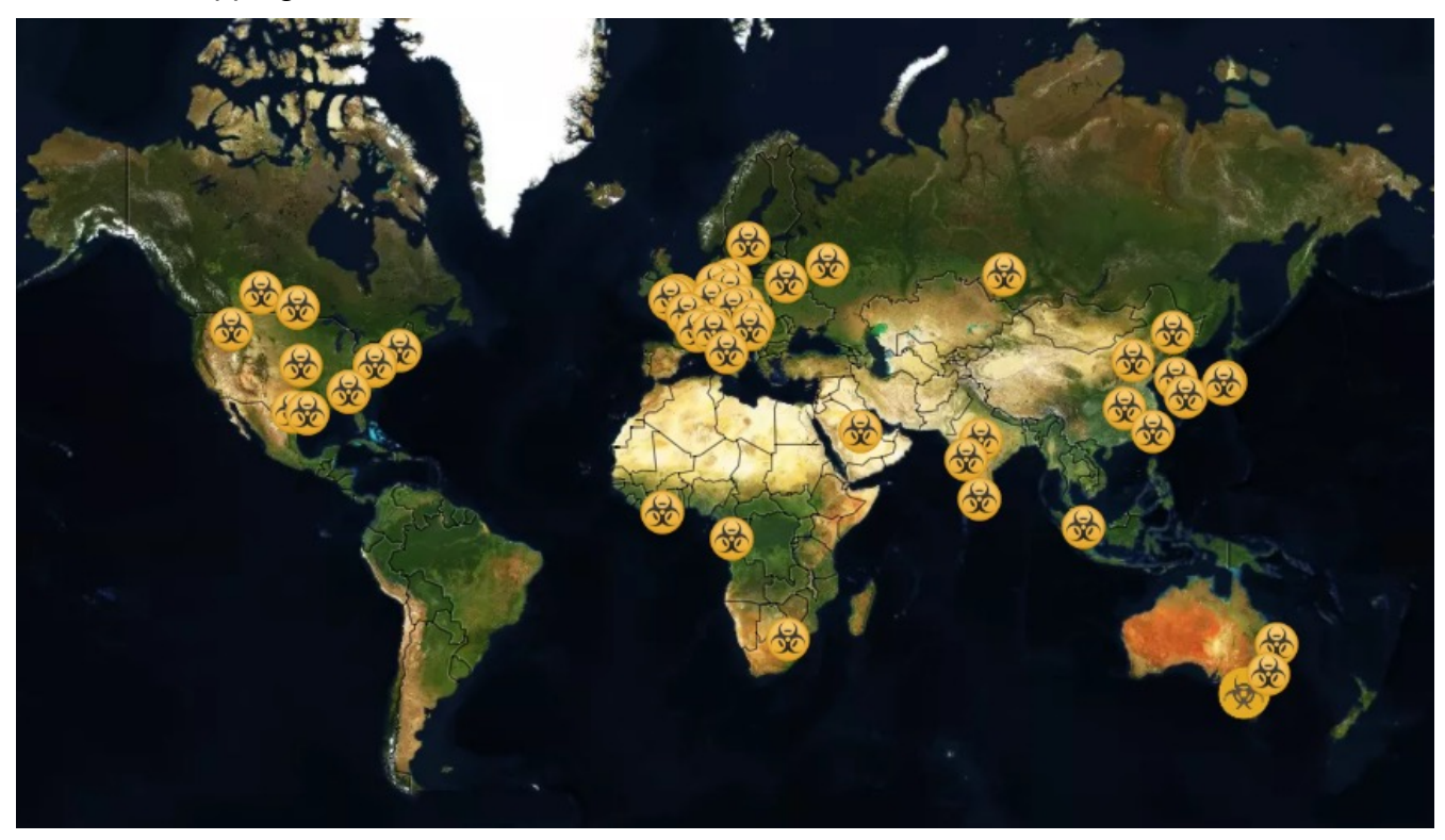
FIGURE 2. Mapping BSL4 facilities around the world

Over the last 20 years, the wider political and strategic context has become much less conducive to multilateral disarmament and arms control efforts than the golden post-Cold War period, and in the last decade the environment has become notably more hostile and difficult. This trend toward competitive multipolarity shows no sign of reversing. Russia's invasion of Ukraine in February 2022, as this report was being completed, has exacerbated tensions between Russia and the West, and is likely to compound difficulties across the board for multilateral processes for some time to come, including in the BWC setting.