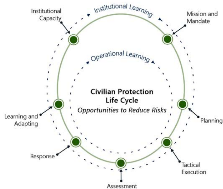
FIGURE 1: Civilian Protection Lifecycle 14

environments. This comprehensive protection lifecycle approach, as developed by CNA 12 , reflects care in civilian harm mitigation being taken at all points in the planning and use of military force and includes learning loops so that militaries can adapt and improve to overcome risks and challenges (see fig. 1).