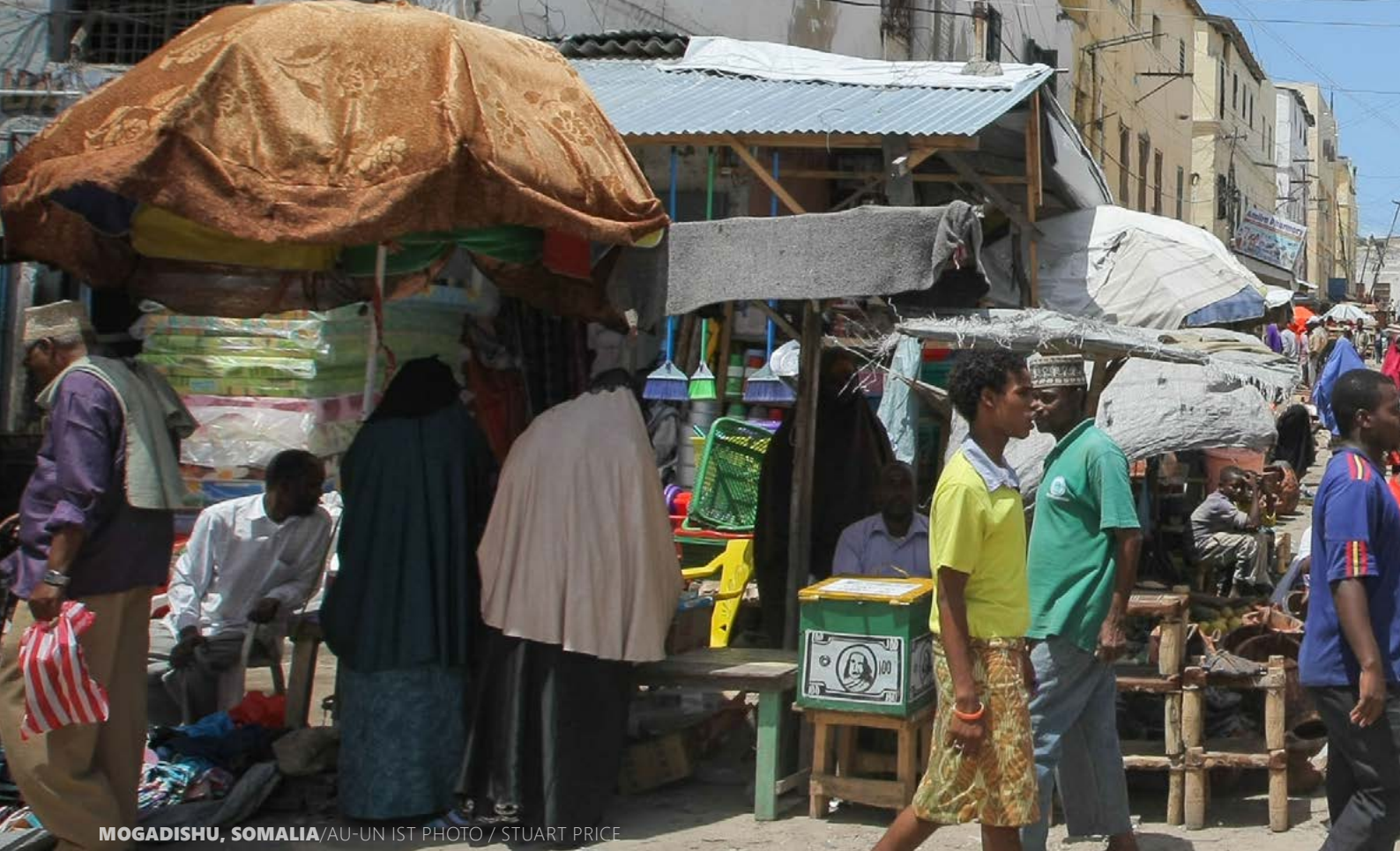
MOGADISHU, SOMALIA/AU-UN IST PHOTO / STUART PRICE

adapt their military policies and practices to address risks, understand impacts, and mitigate civilian harm. A number of States have touted their mix of technological capabilities and robust targeting practices to help address the risks to civilians and civilian objects of warfare in populated areas. While States continue to assess, develop and adapt a range of policies, capabilities and practices to reduce civilian harm from operations, including from explosive weapons, in urban environments, it also raises a series of questions for reflection: