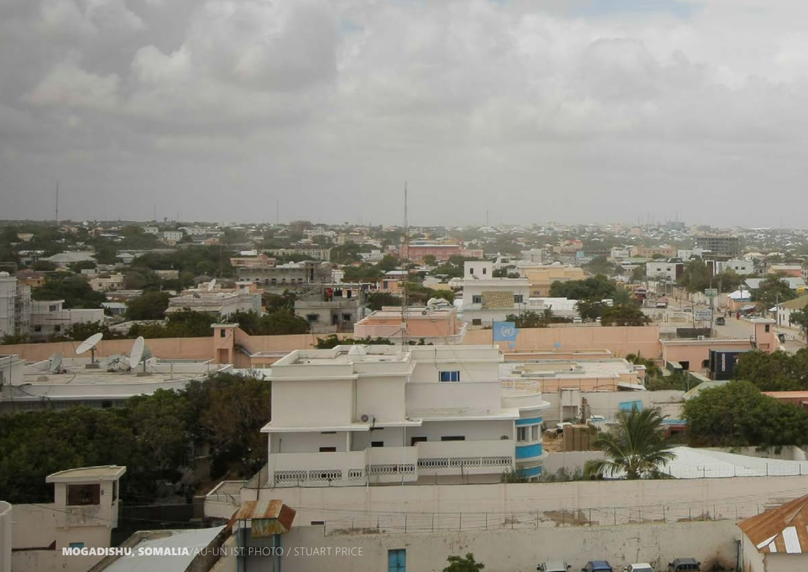
MOGADISHU, SOMALIA

such as the provision of intelligence or fire support with Unmanned Aerial Vehicle (UAV) armed strikes, where neither the State nor the host State have established command relationships with the provider of the assets.