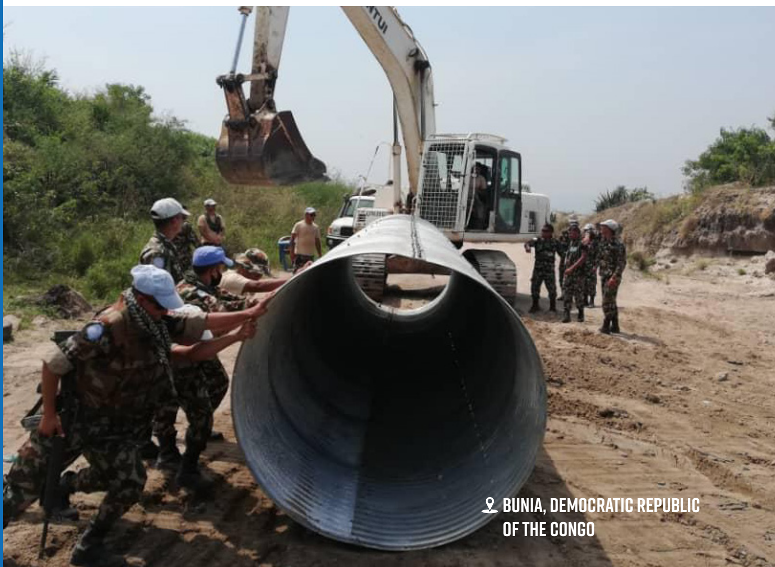
📍 BUNIA, DEMOCRATIC REPUBLIC OF THE CONGO

In strengthening the various pillars of WAM, further support and coordination from the international community are needed to address the numerous challenges faced by the DRC. Additionally, continuous monitoring and evaluation efforts at the national level are desirable to better identify and quantify some of needs that could be addressed by international partners.