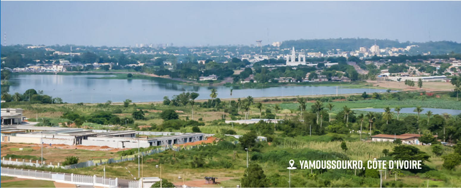
YAMOUSSOUKRO, CÔTE D'IVOIRE