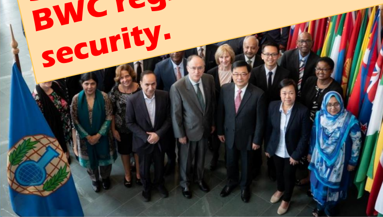
Scientific Advisory Board 2019

OPCW Organisation for the Prohibition of Chemical Weapons