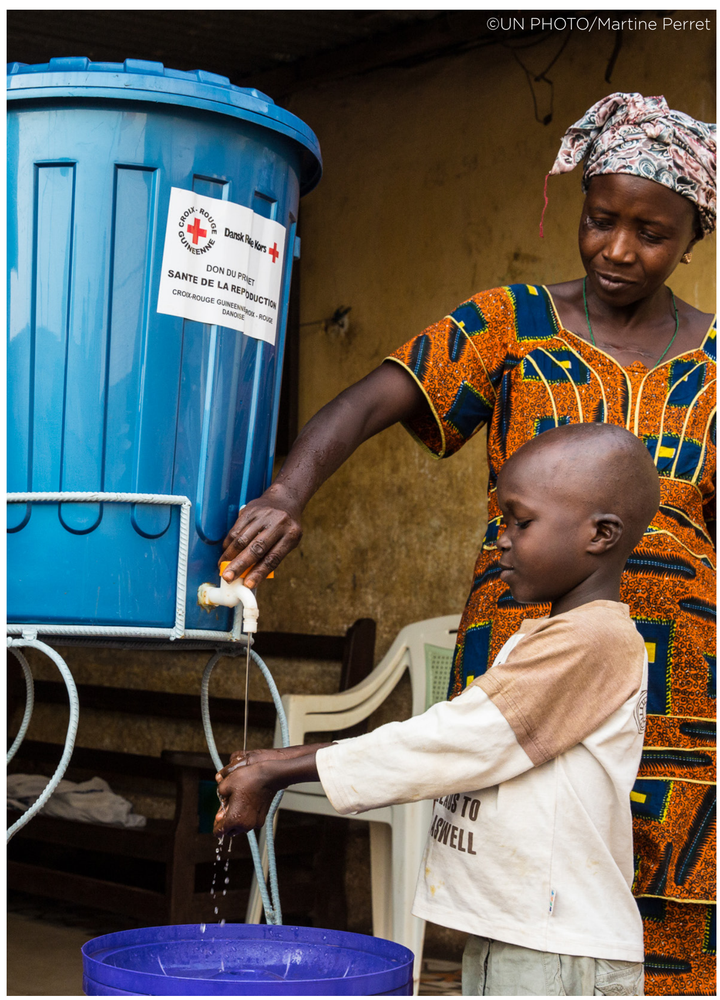
Mother washing child's hands with chlorine treated water at Ebola Prevention and Treatment facility in Guinea.