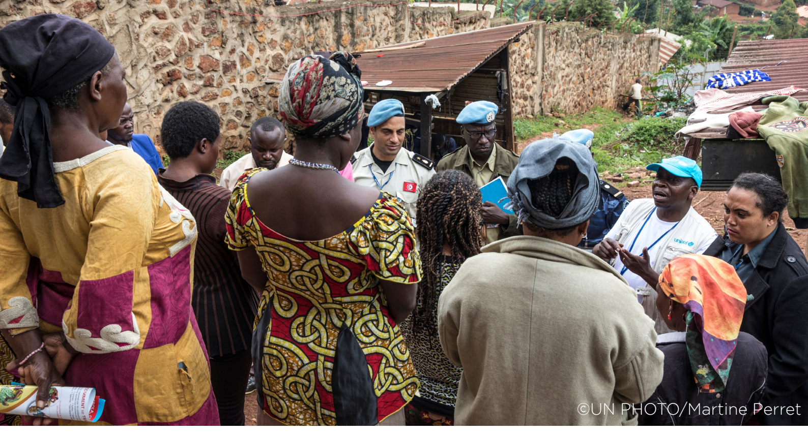
The Ebola task force of the United Nations Organization Stabilization Mission in the Democratic Republic of the Congo (MONUSCO) informs local population about how they may protect themselves against the Ebola Virus.

Certainly, "evidence from South Asia, Africa, and Vietnam suggests that the potential for stigmatization affects women's help-seeking more than men". 86 In turn, this can weaken the accuracy of case reporting as well as the effectiveness of community efforts to offer healthcare services to treat and prevent the spread of communicable disease. 87