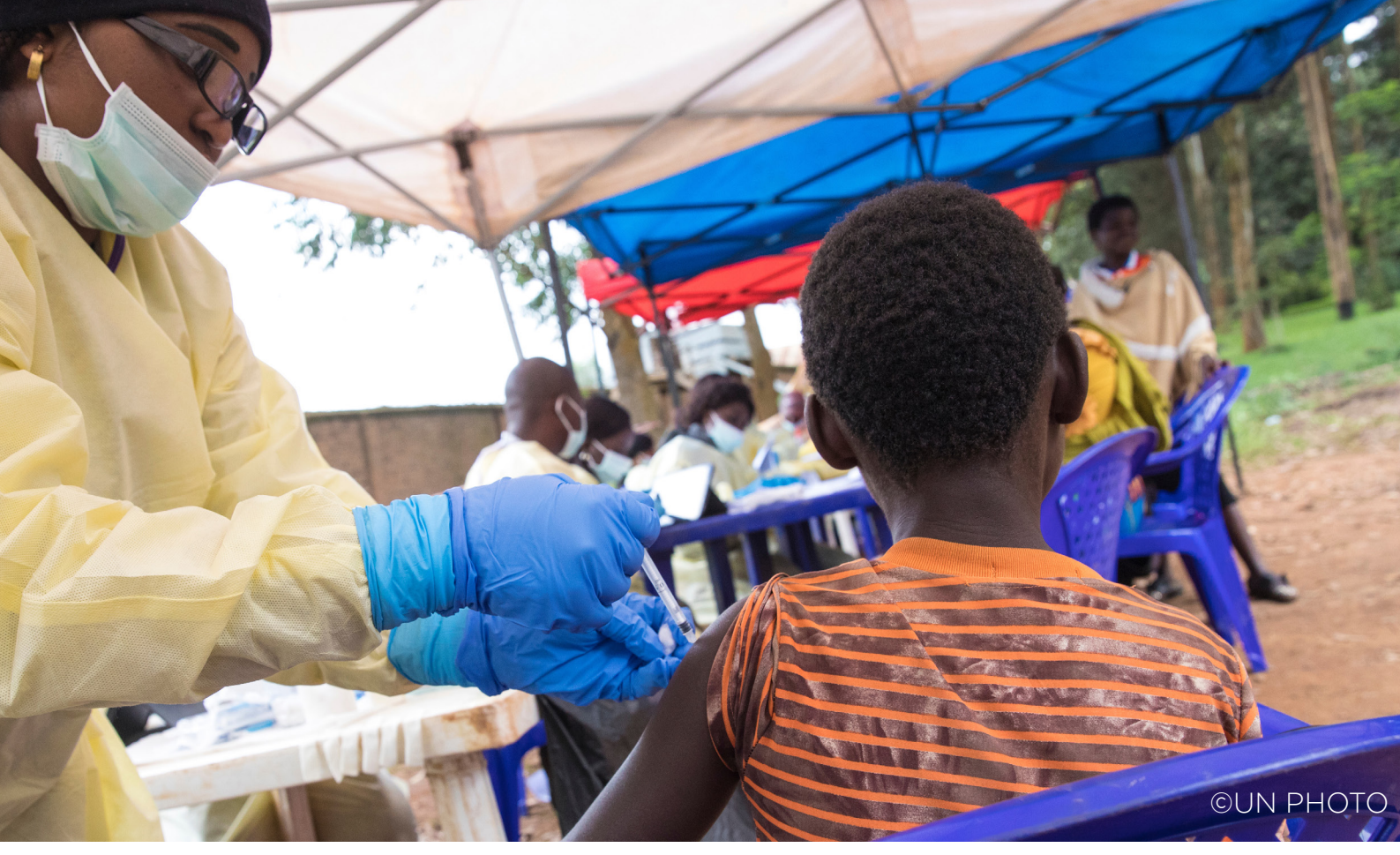
Vaccination Against Ebola.

children may be particularly susceptible to certain viruses.48