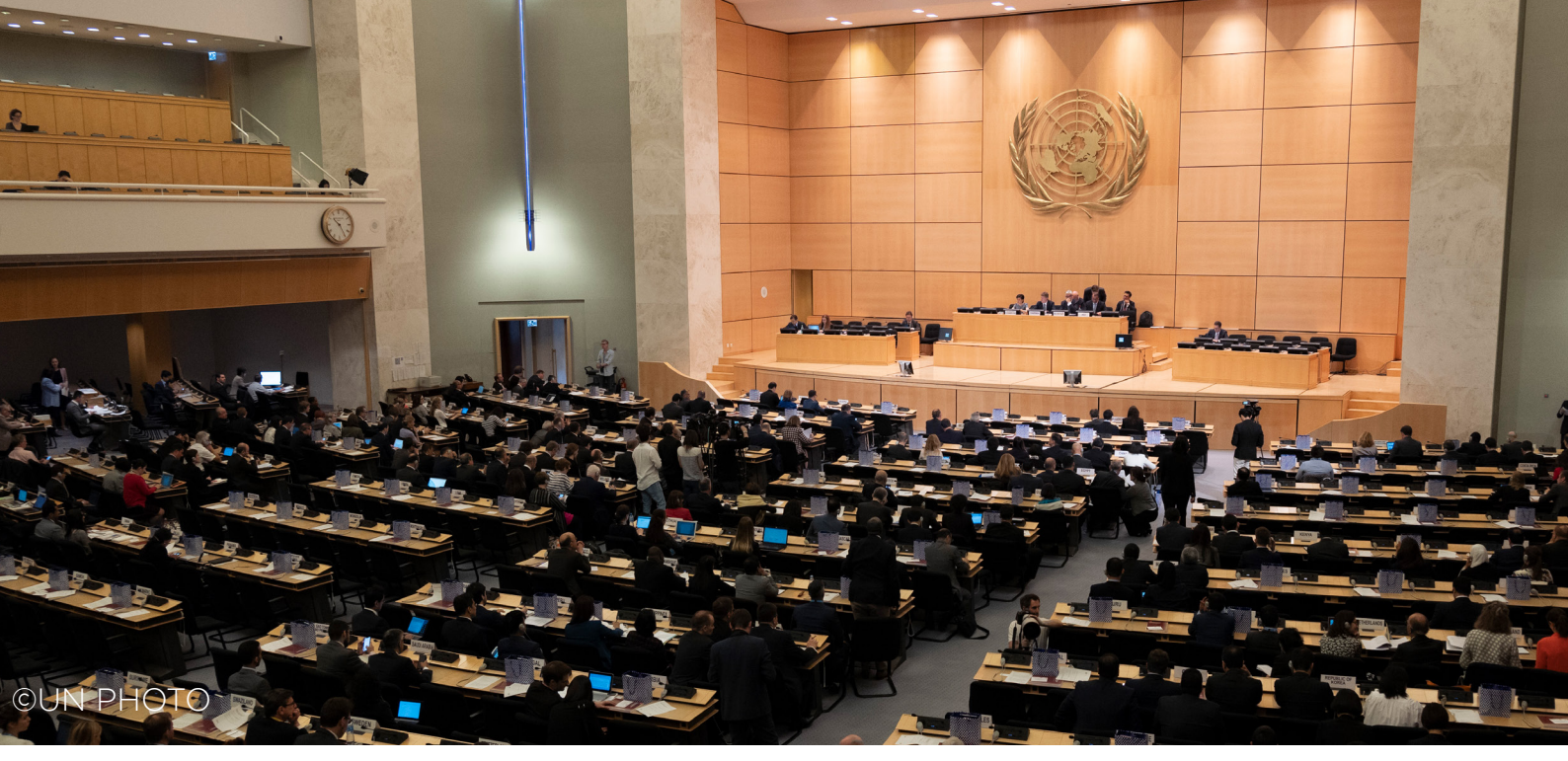
Member States representatives gather for the opening session of the 2018 Preparatory Committee for the 2020 NPT Review Conference.

NPT working papers.<sup>19</sup> The Chair's factual summary from the 2018 Preparatory Committee for the 2020 NPT Review Conference noted the disproportionate impact of ionizing radiation on women, and suggested that this issue should be factored into the discussions in the current review cycle.<sup>20</sup> The Chair of the following Preparatory Committee proposed that the 2020 NPT Review Conference should recognize the disproportionate impact of ionizing radiation on women and girls.<sup>21</sup>