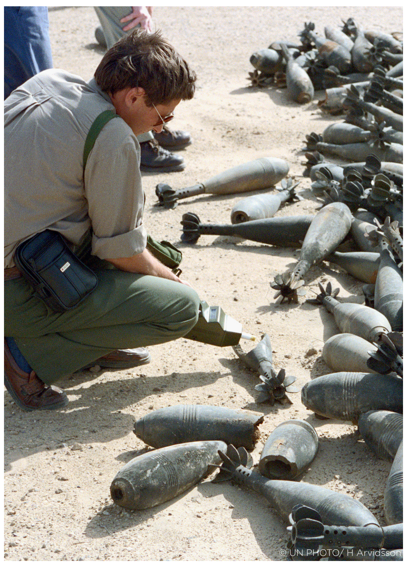
A member of the Special Commission Team (UNSCOM) Verifies Iraq's Destruction of Chemical Weapons at Fallujah Chemical Proving Ground.