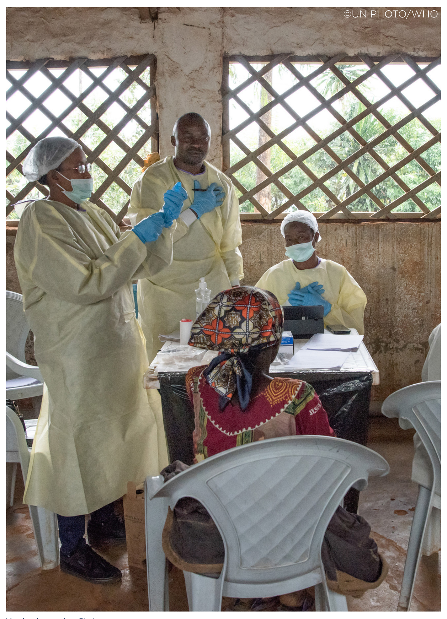
Vaccination against Ebola.